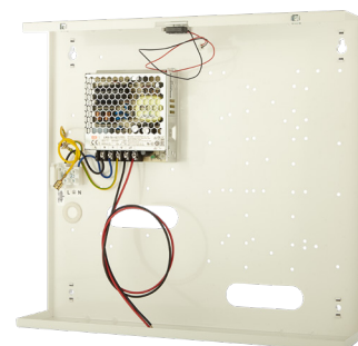
WS4-PS5 Universal aluminium housing, wall mounted, with 1 x 5A PSU