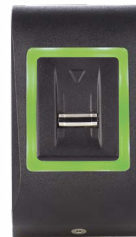
Green LED Access Granted

With green and red LEDs managed by the host