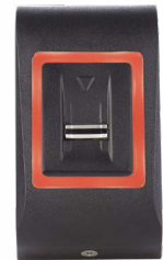
Red LED blinking Access Denied