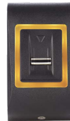
Orange LED Idle Mode