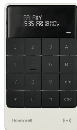
CP061-01 MK9 Keyprox