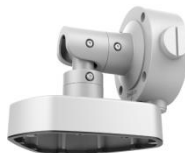
DS-1283ZJ Wall Mount (3-axis Adjustment)