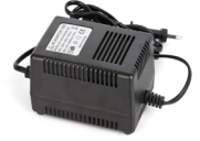
AC24V/3A Power Adapter