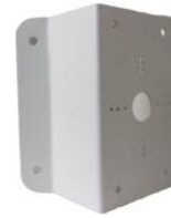
DS-1276ZJ-SUS Corner Mount