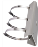
DS-1275ZJ-SUS Vertical Pole Mount