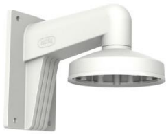
DS-1273ZJ-DM32 Wall Mount